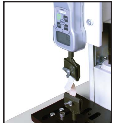
Stand with Optional Grip Performing Peel Test