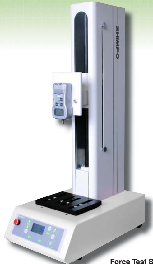
Force Test Stand shown with Force Gauge (Sold Separately)

The FGS-VC's can be equipped with various gripping and compression fixtures and are compatible with all Shimpo Force Gauges as well as most gauges on the market. These features make the new FGS-VC the ideal push/pull tester for the production line or QC lab.